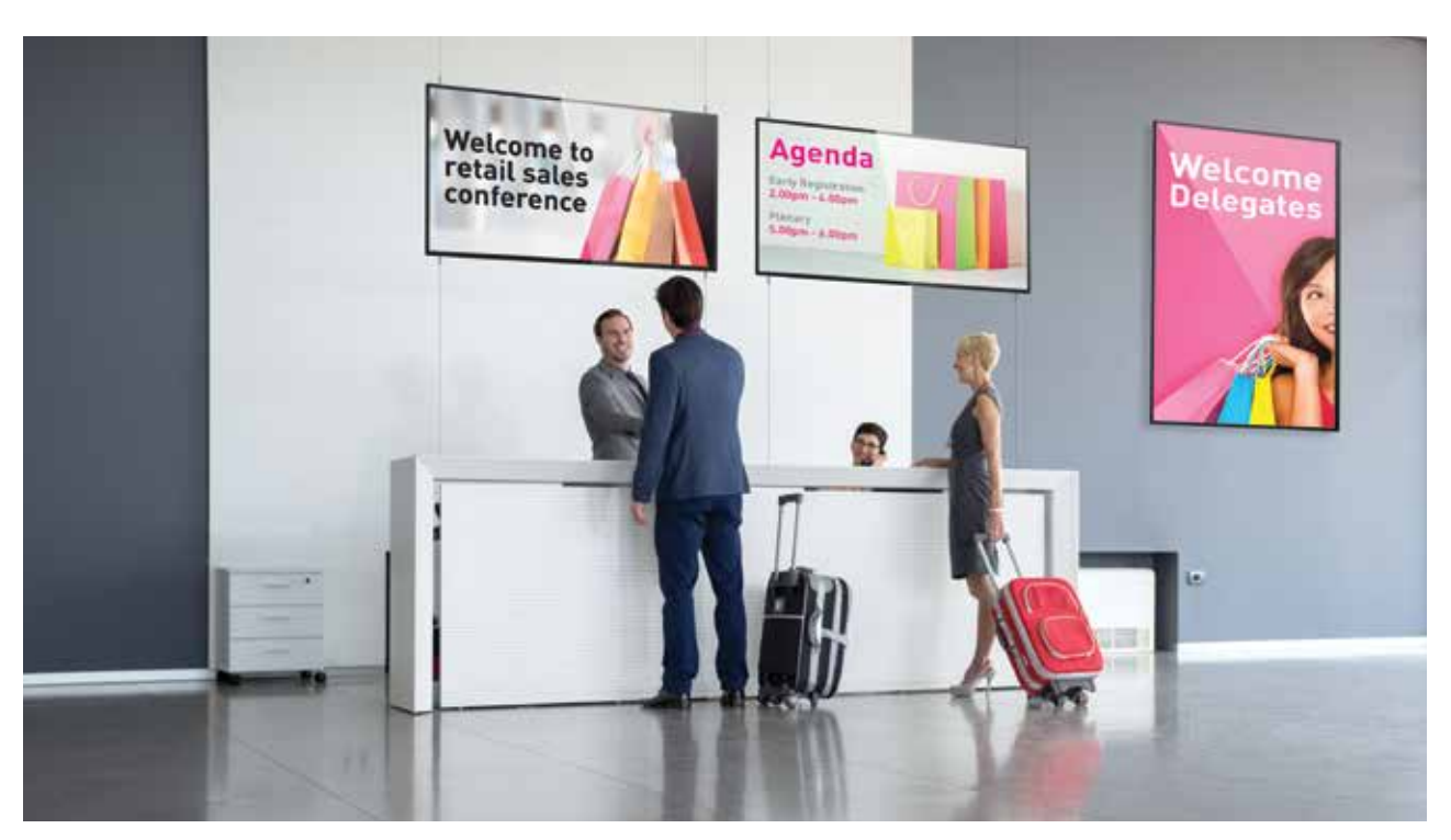
<sup>1</sup>Futuresource Consulting, Professional Display Market Insights, June 2019

This involves complexity, so it's important that businesses can work with suppliers that understand their unique challenges. We want to give our customers the best chance of success and help them to realise the full potential of digital signage for their business. That's why we work closely with a selection of software providers and CMS experts offering genuinely tailored solutions that fit any business need.